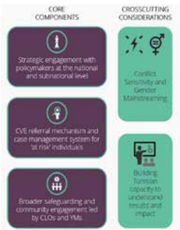
Figure 1: The Jendouba Model

drawing on Dutch and other international good practices. The first 18 months of the programme worked to establish a feasible model, led by the police in close collaboration with the municipal government and other community-based resources.